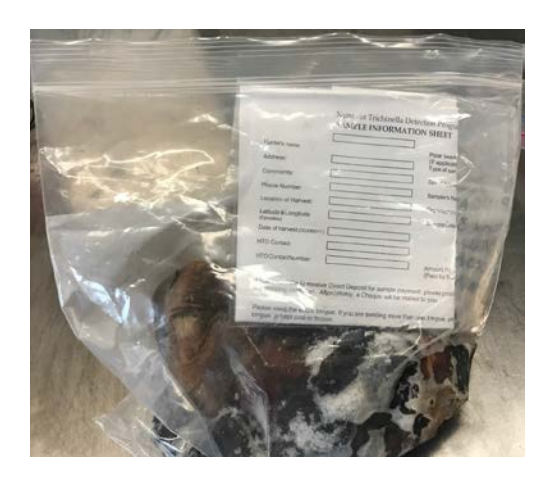
Figure Two: Walrus Tongue Sample with Information Sheet