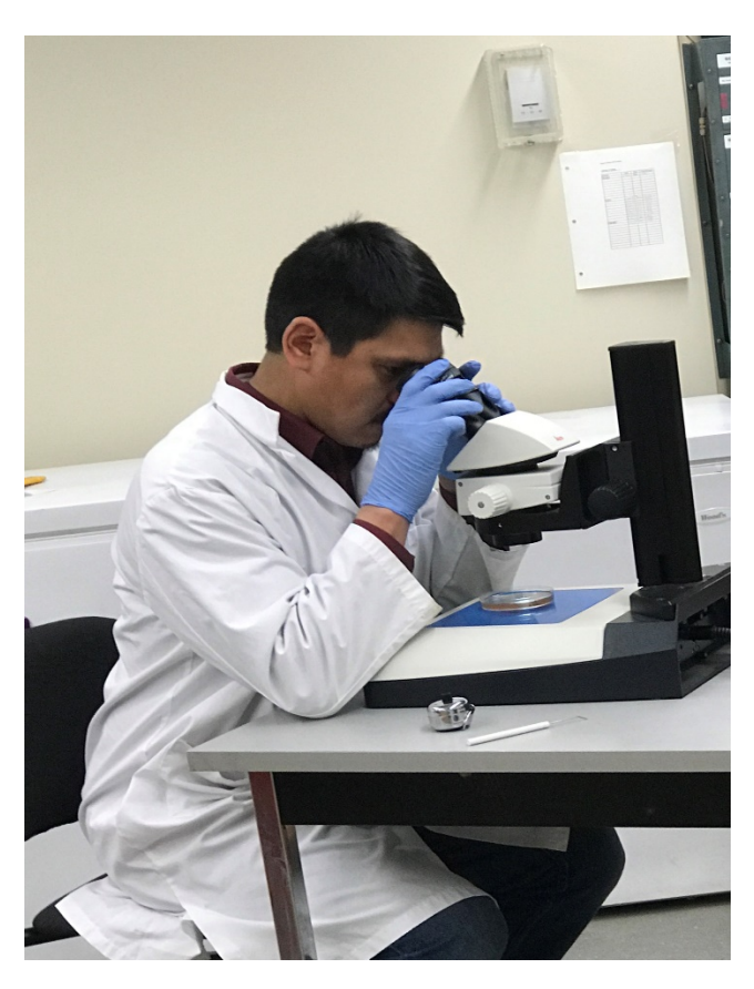
Trichinella Analyst Examining a Sample

a 24-hour period. Test results will be reported by the Department of Health. Please ensure your phone number is included in the Sample Information Sheet.